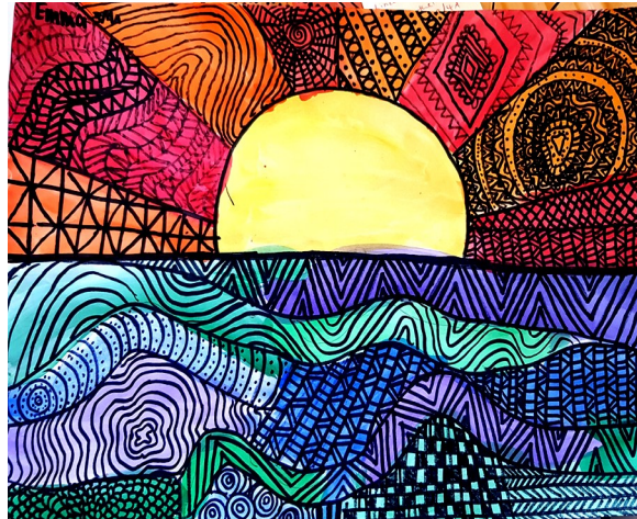
Grade 3/4 warm and cool colour landscape