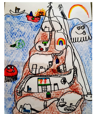
Grade 1/2 cross-section of an underground house