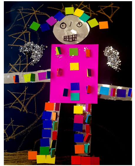
Foundation shape robots